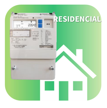
MCS301 for Residential

Our portfolio facilitate the user decision making and even can resolve situations with automatic actions for improving their energy performance by enabling them to adapt effectively to different conditions or modes of operation.